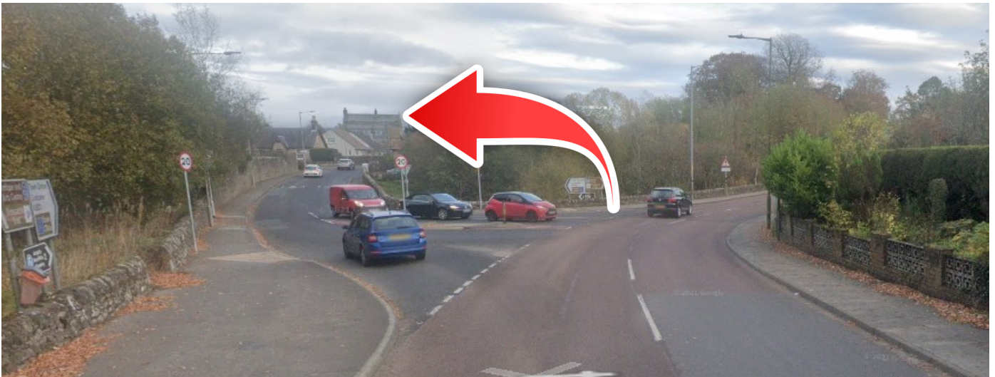
Into Doune, take left at the junction for A820 (0.8 Miles)