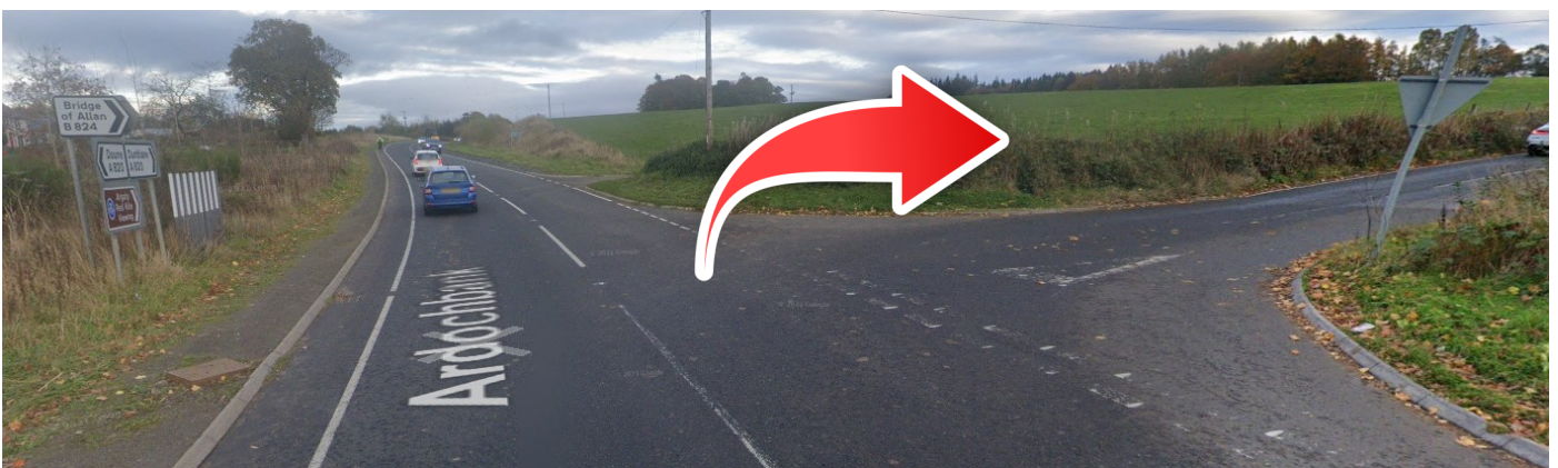
Coming out of Doune, take right at the junction for B824 (Bridge of Allan) (3.1 Miles)