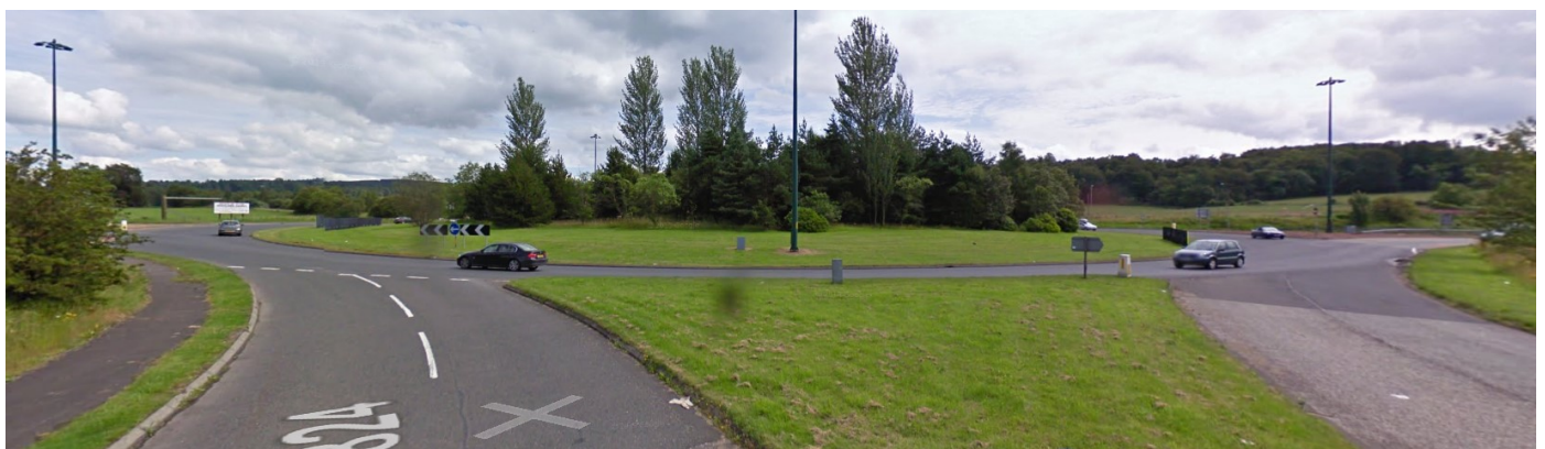
At the Roundabout, take fourth exit (right) onto M9 for Stirling/Edinburgh/Glasgow (6.6 Miles)