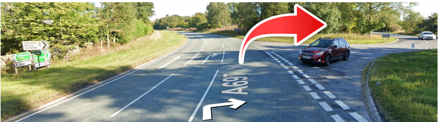
At the junction, turn right onto A6089 (12.4 Miles)