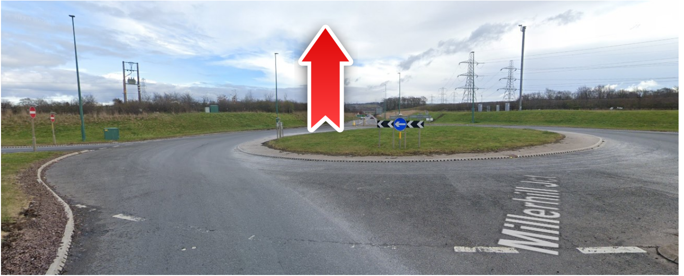
Next Roundabout, take second exit (straight) for A68 (15.7 Miles)