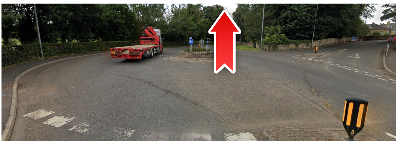
At the Roundabout, take first exit (straight) staying on A6089 (0.9 Miles)