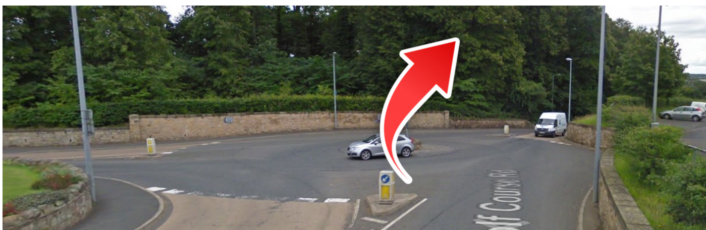
At the Roundabout, take second exit (straight) for A6089 (0.5 Miles)