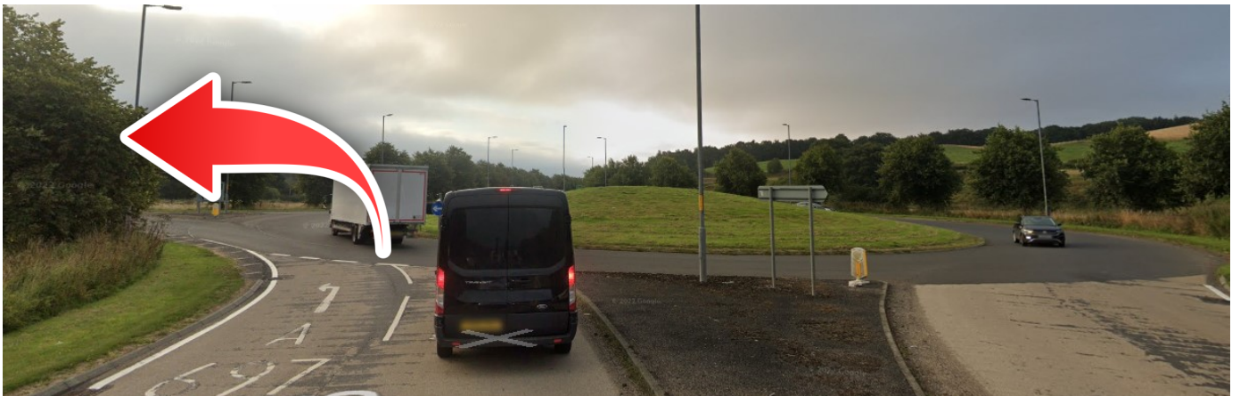
Next Roundabout, take first exit (left) for A697 (7.7 Miles)